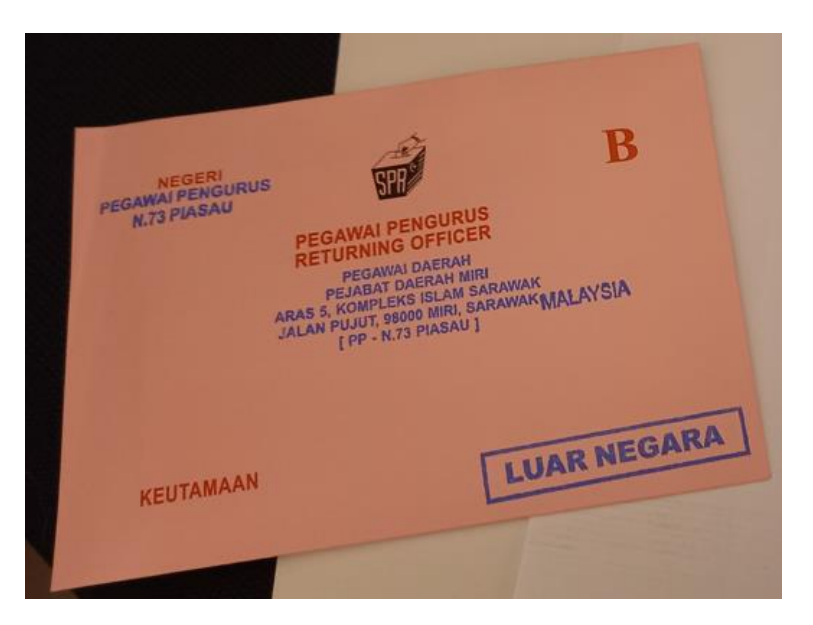
Figure 3 – Postal vote to be couriered back to Sarawal