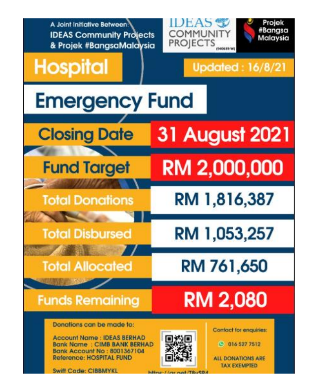
Figure 2 – Project Bangsa Malaysia's Hospital Emergency Fund project