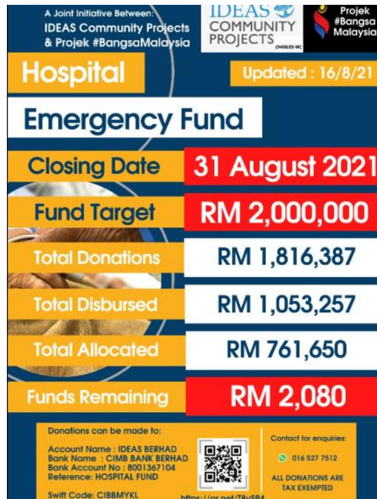
Figure 2 – Project Bangsa Malaysia’s Hospital Emergency Fund project