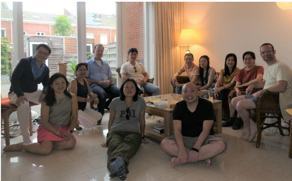
Figure 1 – Summer “makan-makan” gathering